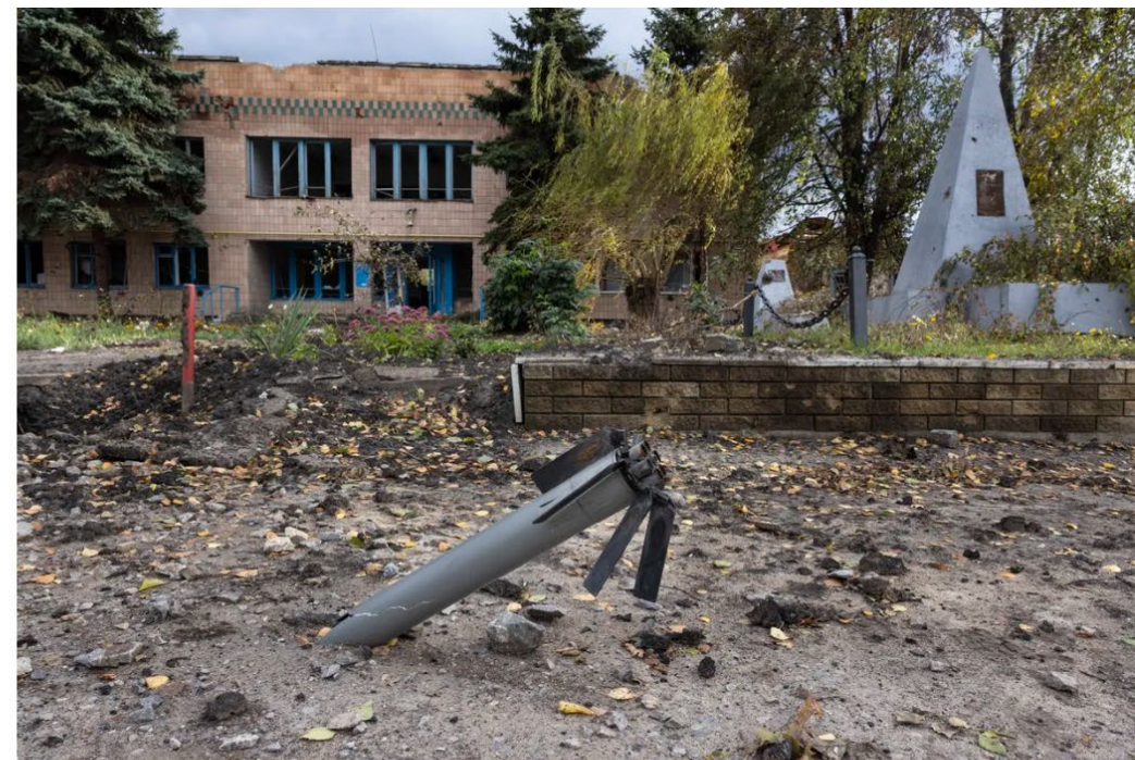
Munition on a road in Drobysheve, Ukraine, on Oct. 5.