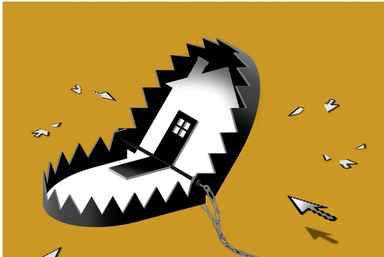
ILLUSTRATION BY ANSON CHAN